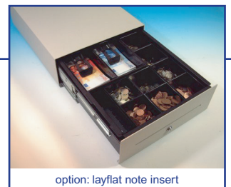
option: layflat note insert