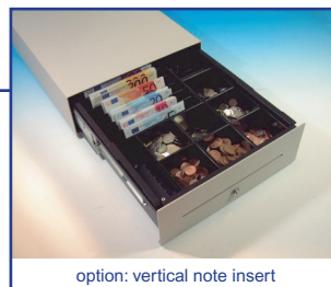
option: vertical note insert